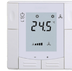
HID-Ti10 Recommended thermostat for 2 and 4 pipes